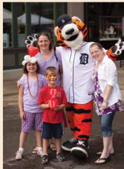
A family at the Family Festival for Hope poses with the Detroit Tigers' mascot, Paws.